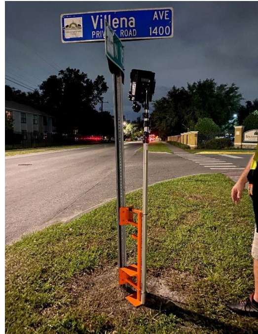
Attached securely to public property