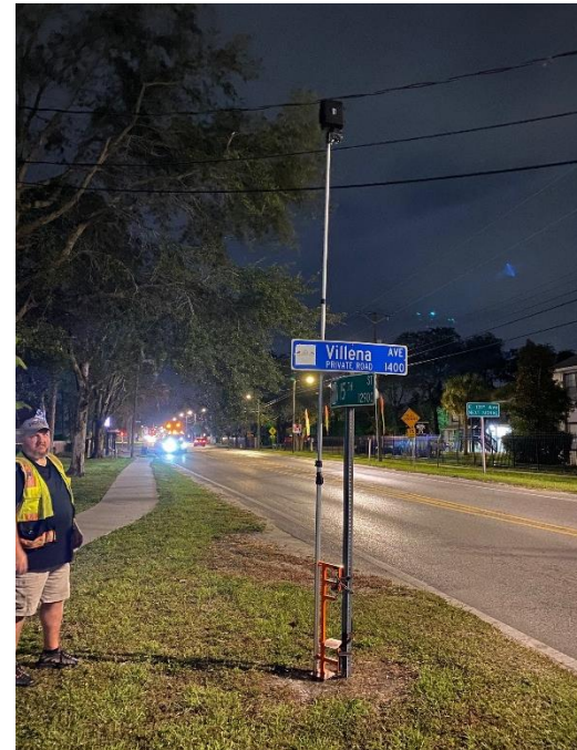
Telescoped for optimal vantage