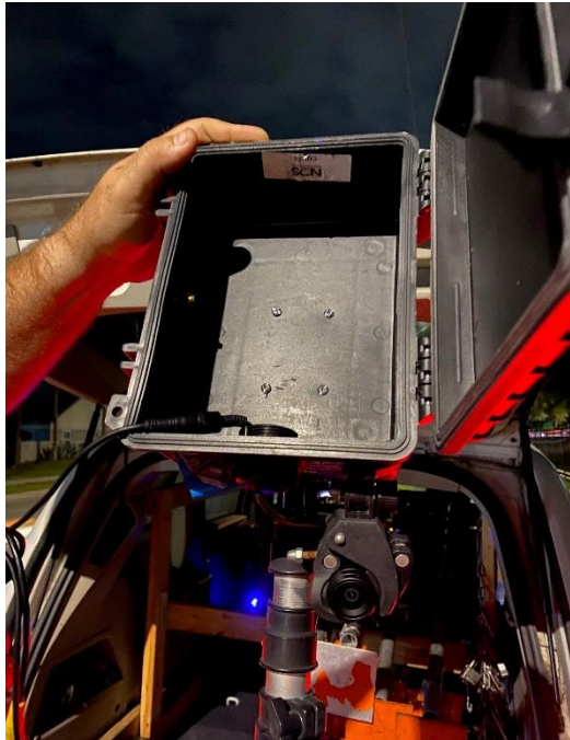
Camera beneath box housing battery and recording device