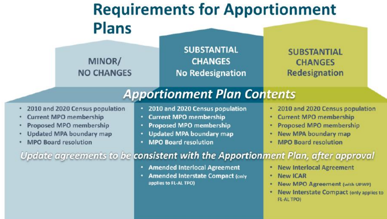
Figure 3. Requirements for Apportionment Plans